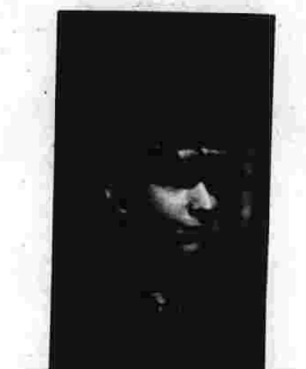
Wear what you like.

Anyone interested and willing to serve can join the staff members at any time. Despite the loose structure, every job gets done and the Depot is sometimes able to give an evening's profits to the United Fund or the Revitalization Corps in Hartford.