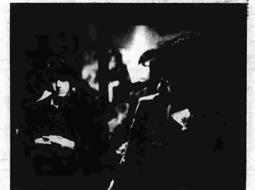
The performers often create a mood of quiet contemplation.

Personal Growth Dayson, "Have Price says that a tremendous amount of inner activity goes on here, a lot of personal growth."