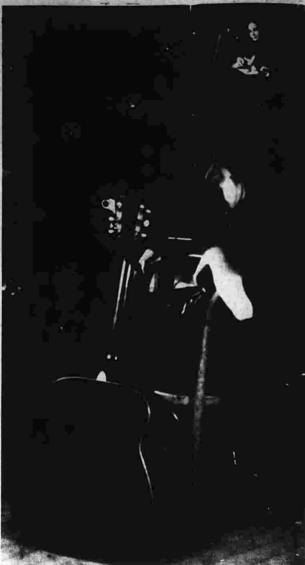
While listening to a singer, another waits with her guitar.