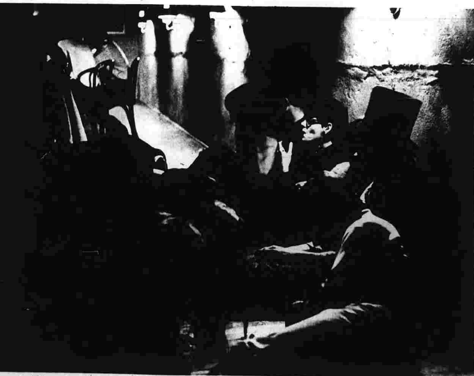
A staff member said, "We aren't stuffy at the Depot; you can sit and talk and listen wherever you like."