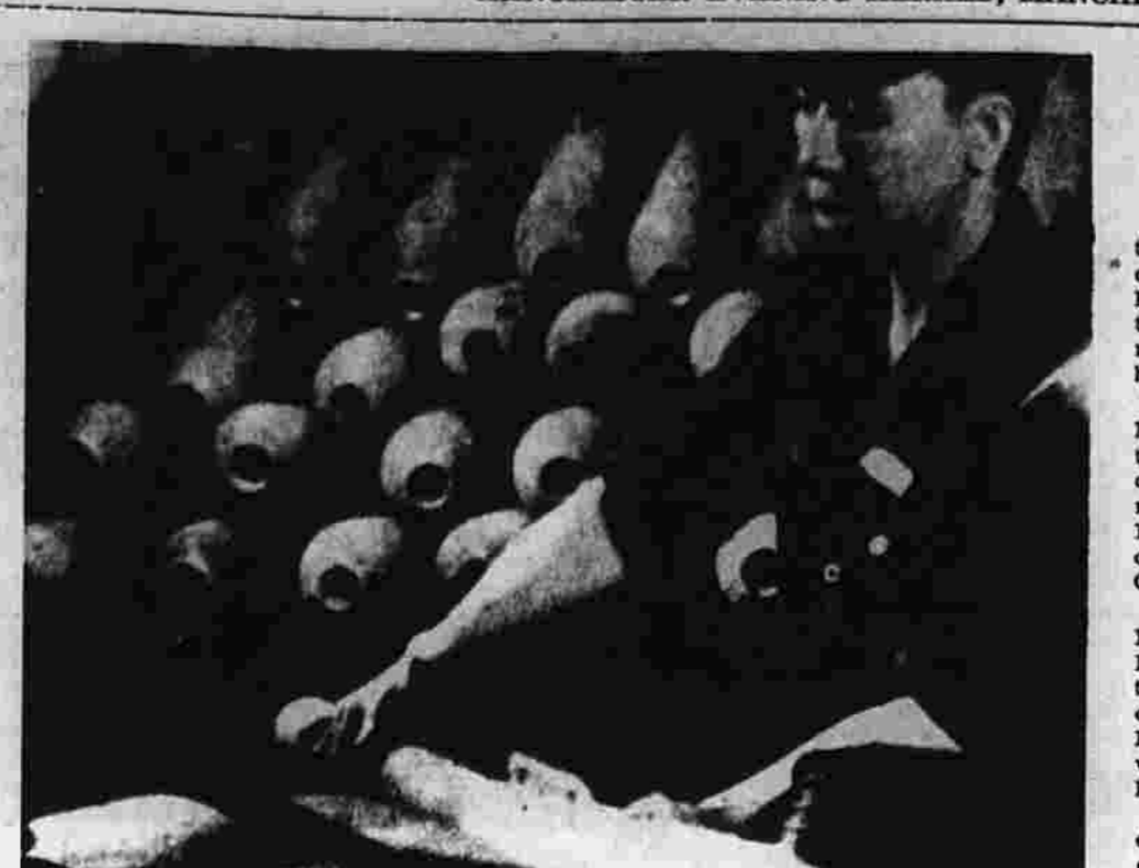
A uniformed worker in a Viet Cong jungle munitions factory inspects cast iron mortar shells. Other shells in the background are stacked awaiting their fuses before being shipped to combat areas.

Warfare Study Bill In House Committee HARTFORD, Conn. (AP) — A legislative proposal to study Connecticut's welfare system, already passed by the Senate, was shut into a House committee Thursday before House Republicans could debate it.